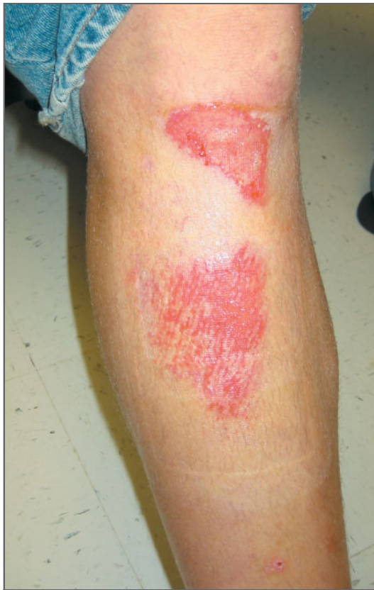
Figure 2. Photograph of an Uninfected Skin Abrasion (Turf Burn) on a St. Louis Rams Professional Football Player in 2003.

ticipants, children, prisoners, military recruits, and men who have sex with men. After each of the five additional digestions, the isolates again had indistinguishable patterns. This clonal subtype is now classified as pulsed-field type USA300-0114. All USA300-0114 isolates contained the gene for Pantone–Valentine leukocidin as well as the gene complex for SCC _{mec} type IVa resistance. The USA300-0114 subtype has been determined to fall within sequence type 8 on multilocus sequence typing.